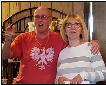
(file photo from 2022)